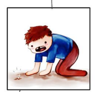
HOLD THE TOOTH BY THE CROWN