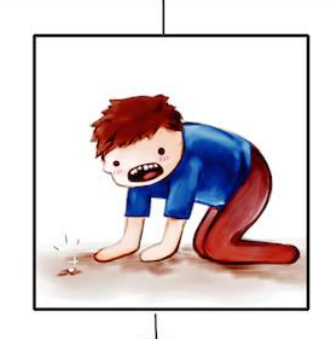
FIND THE BROKEN PIECE, IT CAN BE GLUED BACK ON!